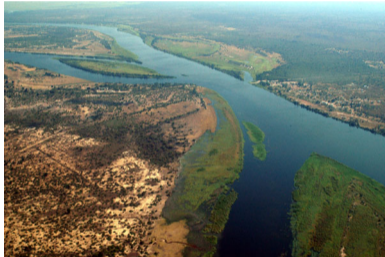
Figure 1: Pictured: Namibia, Zambia, Zimbabwe, and Botswana