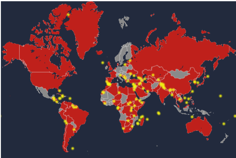
Figure 1: All Countries with Active Territorial Claims (CIA Factbook, Metrocosm)